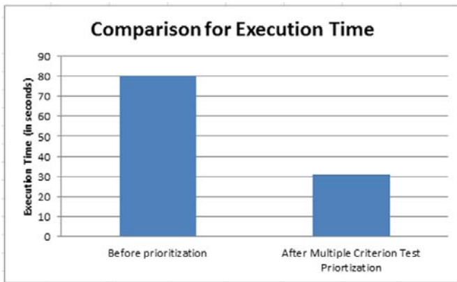
Figure 1: Execution time variation of proposed and existing work

The primary concern of the software testing process is to save testing resources and to find maximum bugs from limited resources. For providing optimized solution for the same we have done changing in regression testing process by introduction of multiple criteria’s for testing. Basically we did here in our research ad hoc regression testing, testing in which test cases are made only if any bug found in application. Testing is done in two programming languages for checking compatibility and test case prioritization is consider in both of the languages for same application.